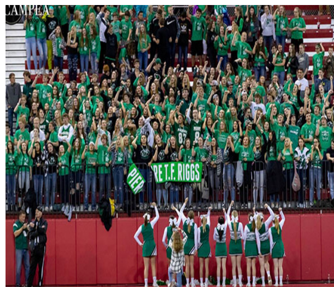
Riggs students do a cheer in the student section