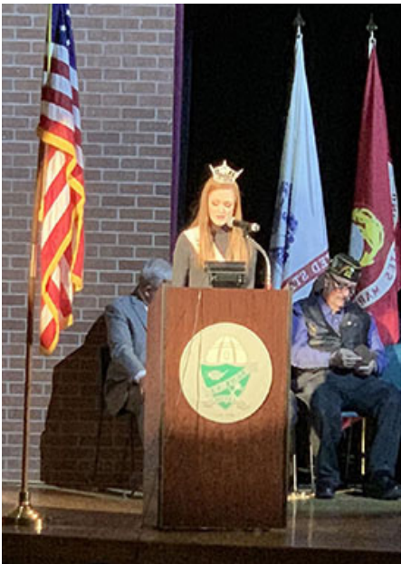
Miss South Dakota speaks at Riggs Theater