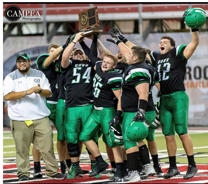
Senior football players celebrate after their back-to-back championships.